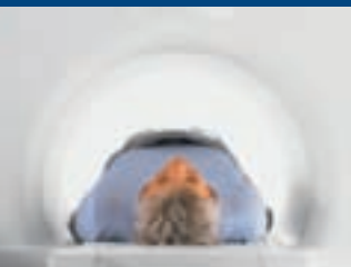
The Espree allows for a roomy 12" of headroom